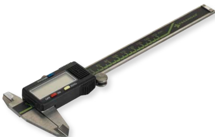
Professional digital caliper reading to 0.01 Mm