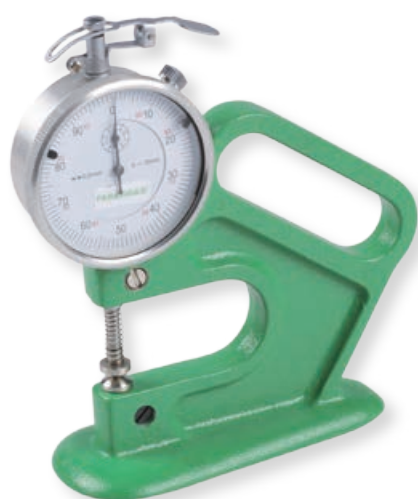
Dial thickness gauge with base