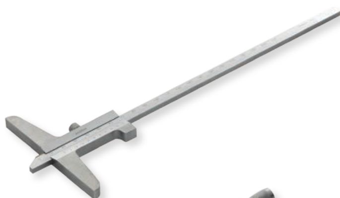
Professional depth caliper, reading to 0.02 Mm