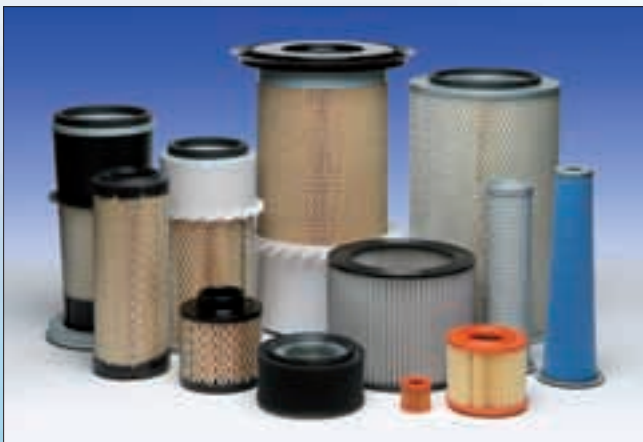
Primary cartridges Safety cartridges Special on drawing