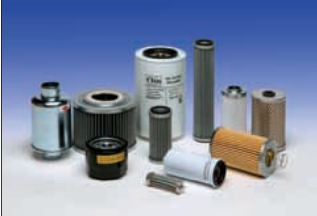
Spin-on; Immersed; Hydraulic; In-line Special on drawing