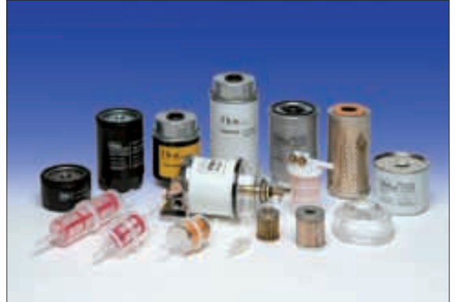
Spin-on; Immersed Complete filtration units Plastic; Special on drawing