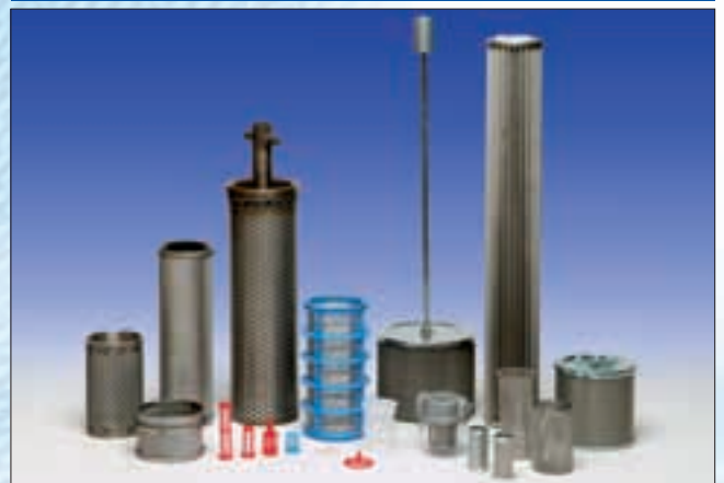
Stainless steel water cartridges Plastic filters for water and detergents Filters for special applications (gas, solvents, paints, corrosive fluids etc.)