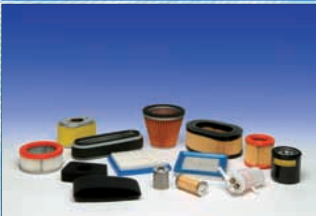
Air, oil, fuel filters for lawnmowers and small industrial engines